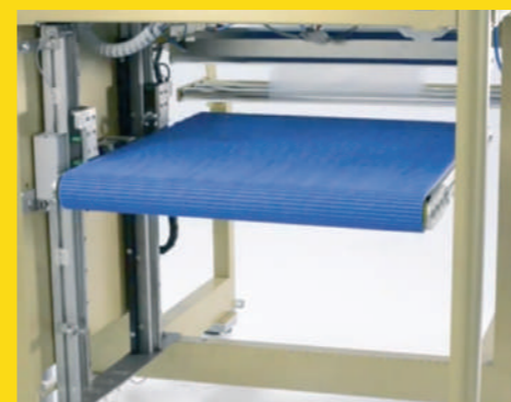
Heavy product and exit conveyor